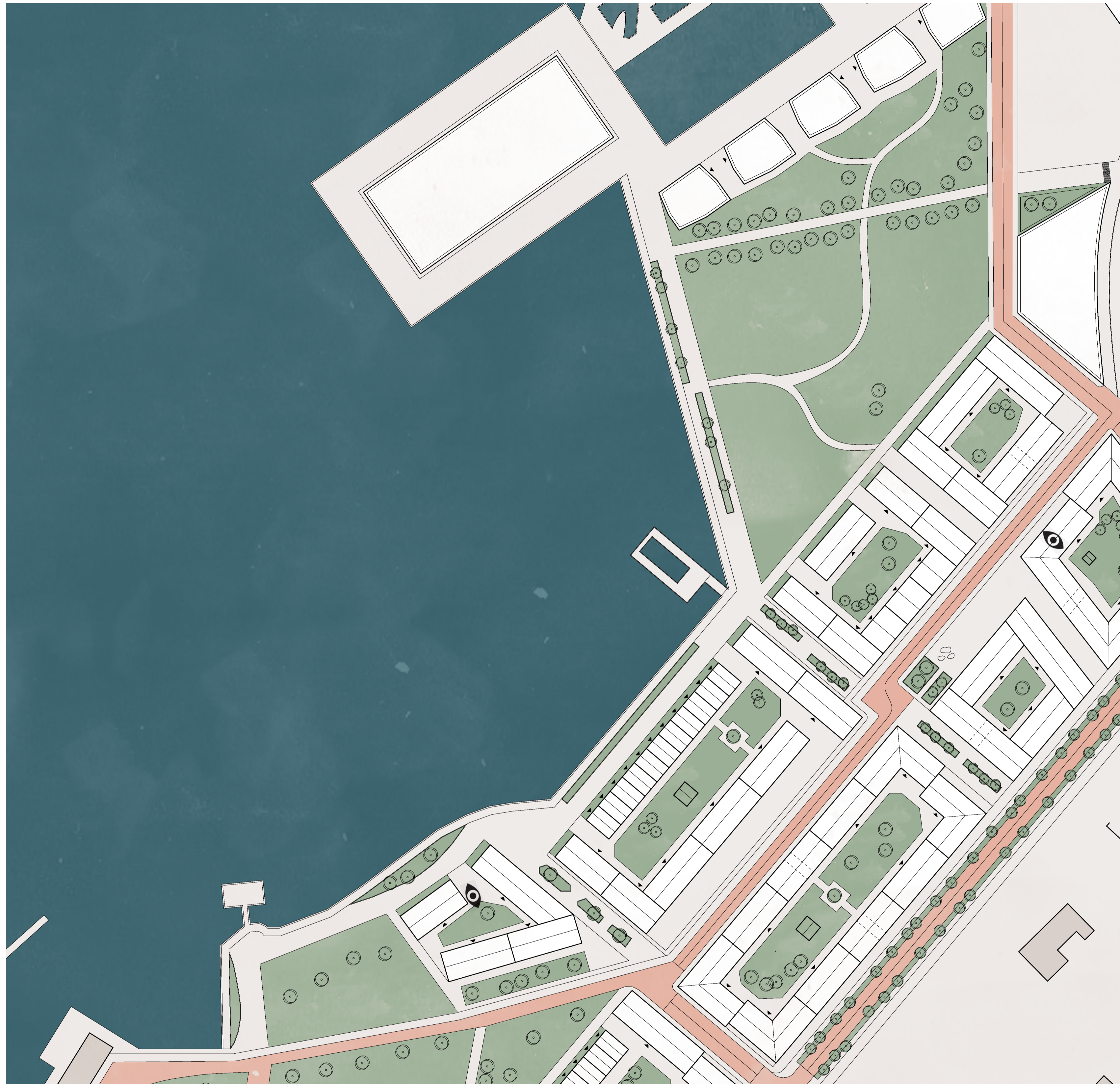
Planutsniit 1:1000 (A1)